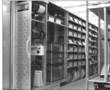
ES-2000 Driver's side shelving