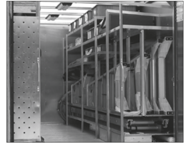
ES-2000 Curbside shelving