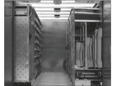
ES-2000 Rear view